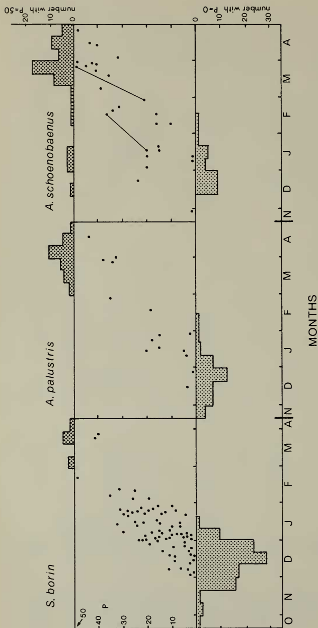
Fig. 3 Primary moult scores of three migrant species caught at Nchalo, plotted against date. Numbers of unmoulted birds (P=0) and completely moulted birds (P=50) are shown (in the histograms) grouped by 10 d periods. Scores of two recaptured A. schoenobaenus are joined by straight lines. Data for 1973/74 to 1978/79 are amalgamated.